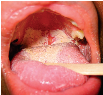
Occupied territory... 'oral thrush' is one of the more clinically obvious manifestations of Candida albicans

There are many factors in our modern society that can upset the ecological balance of the body, weaken the immune system and thus allow the yeast to proliferate. Of these, the major risk fac-